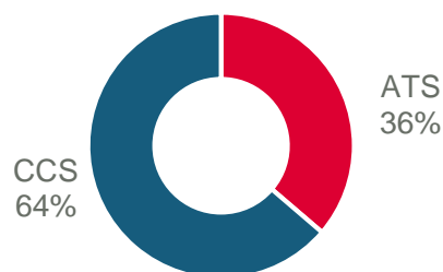
Q1 2023 % of Total Segment Income